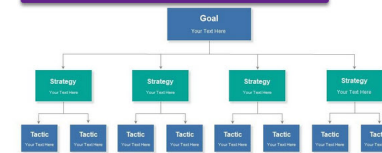
Goal model and business objectives model