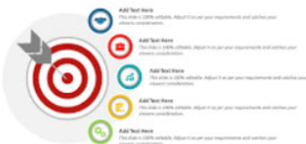
Business goals and objectives